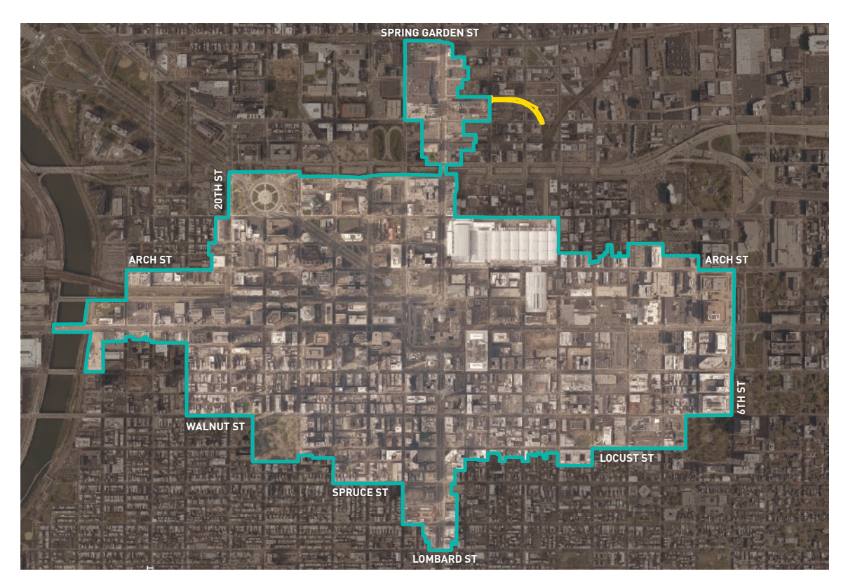
Center City District includes 233 blocks and more than 1,500 benefitted properties within its boundaries. This proposed plan and budget includes a small boundary extension, adding no additional properties except the surface area of Phase 1 of the Rail Park, a public park which the CCD will help maintain in partnership with Philadelphia's Department of Parks & Recreation, the Streets Department and the Friends of the Rail Park. This proposed expansion, highlighted in yellow, will increase the geographic area maintained by the CCD by 0.13%.

This plan and budget for the period 2018-2022 keeps the CCD's primary focus on the basics, devoting more than 70% of assessment revenues to programs for a clean, safe, attractive and well-managed public environment. The balance of revenues supports capital improvements, research, planning, management and communications strategies that bolster the attractiveness and competitiveness of Center City.